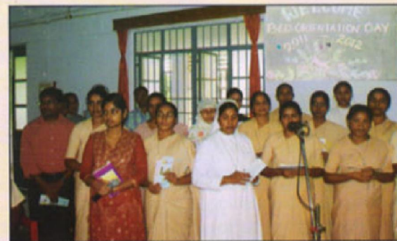
Some of the newly inducted B.Ed. Students