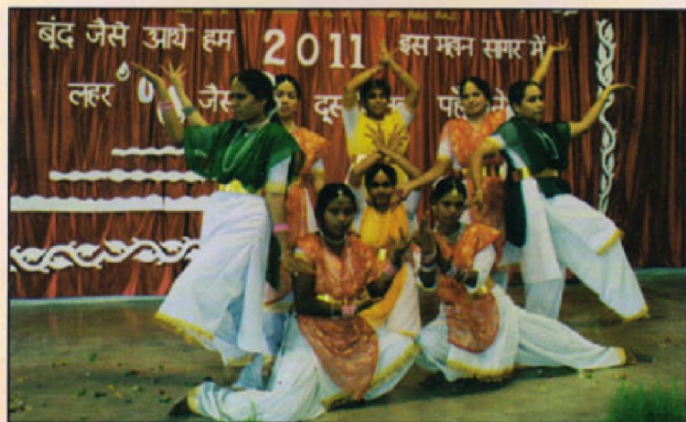
A group dance with lights being performed