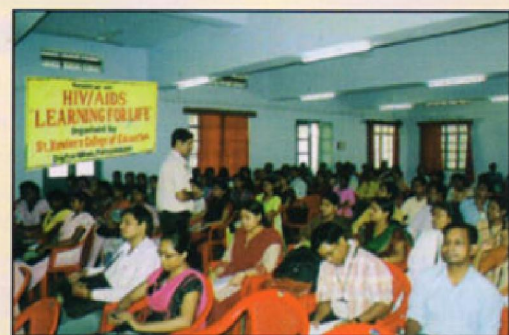
A workshop on AIDS 'Learning for Life'

All our B.Ed. students went through English speaking classes, dealing with basic grammar, communicative skills and basic elements of English. They were divided into small groups. The faculty members were assigned to guide and instruct them. This was an effort by the faculty members to help the would-be teachers to speak English and make use of it in their work.