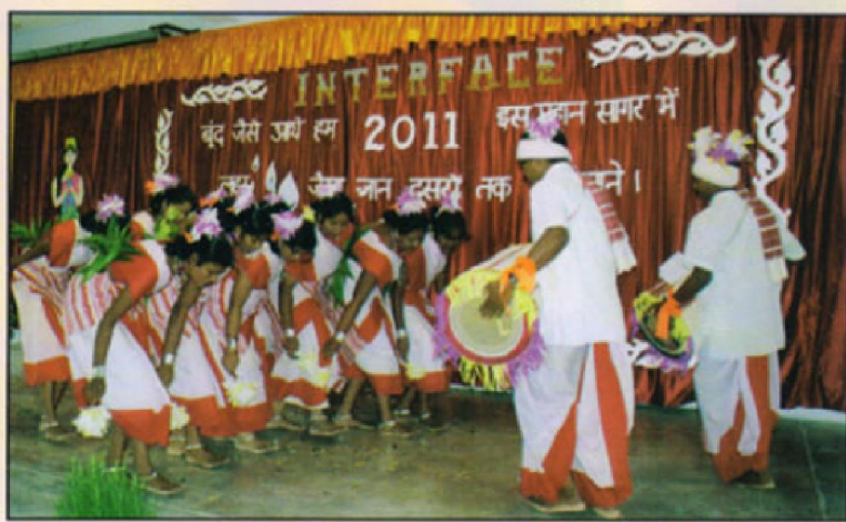
A folk dance in progress