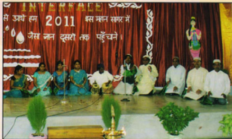
A group song representing the cultural homogeneity of the country

entertaining items were presented to regale the audience. It was an evening of fun and fellowship. The programme ended with a light refreshment served to all.