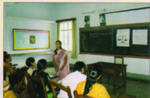
Speech Drill in progress