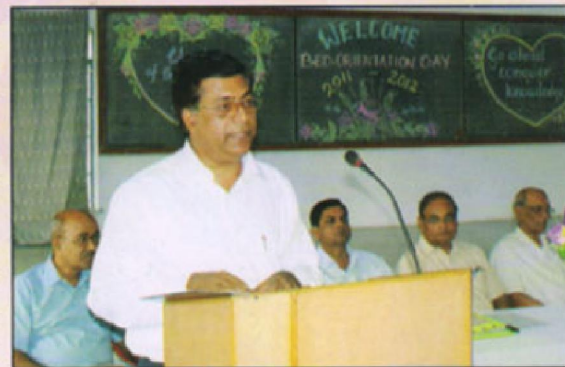
Principal welcoming the new B.Ed. students

After the Principal's address the faculty members introduced themselves. A brief introduction of the various activities was given which are to be held during this academic year. The programme ended with the college anthem with a word of thanks.