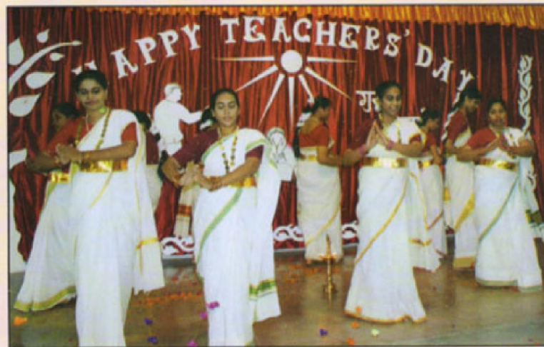
Glimpses of the colourful and entertaining programme presented by students on occasion of Teachers' Day