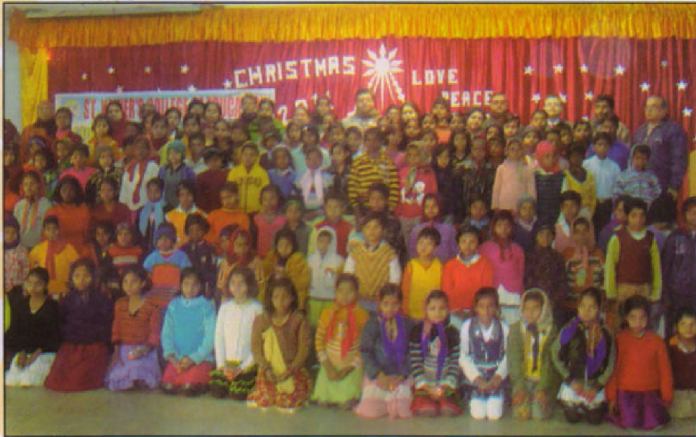
SXCEAA Alumni celebrating Christmas with children of neighborhood

तैयार नहीं तो हम मृतक के समान हो जाते हैं। शिक्षा हमें मानवीय मूल्यों को सिखाता है। यही मानवीय मूल्य हमें निरंतर आगे बढ़ने में मदद करता है।