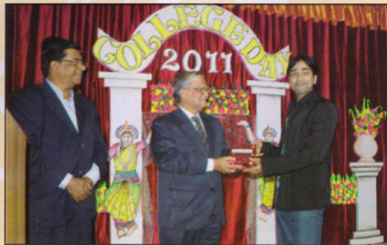
Awards for winners of Essay Competition