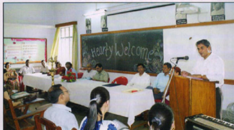
Views of the Orientation Programme, 2012-2013