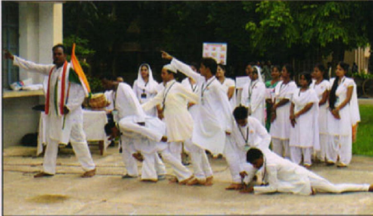
A presentation on Independence Day ▲