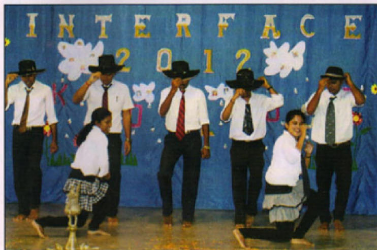
Que Sera Sera . .

The programme ended with light refreshment.