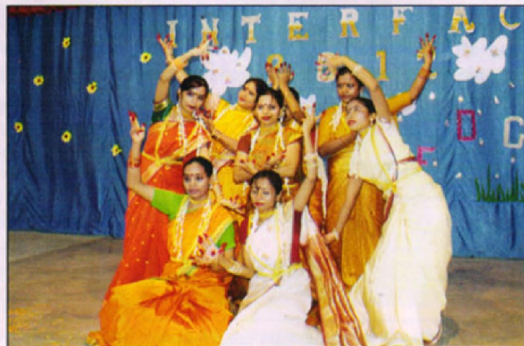
The colourful Nagpuri group dance