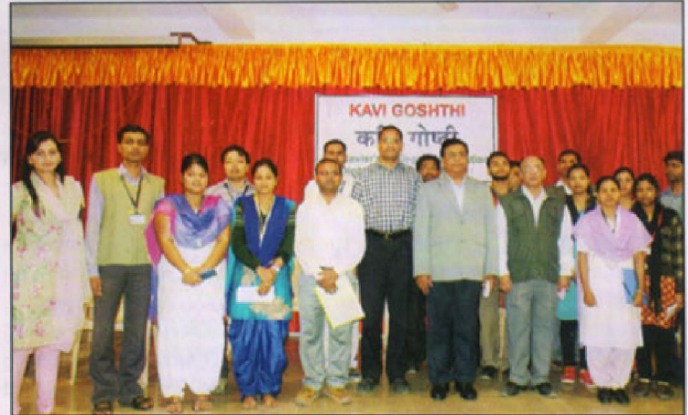
Kavi Goshthi : Precipitants and award winners