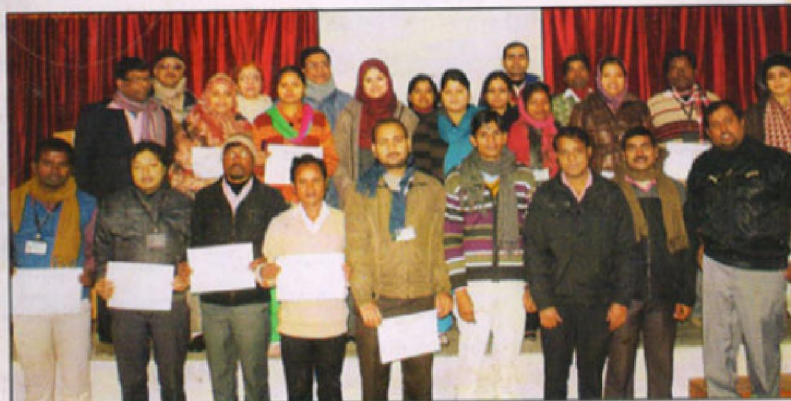
Quiz Contest participants with Fr. Principal and teachers

College conducted a quiz competition on 12th January, 2013 Saturday to apprise students about the current affairs. The quizmaster gave tips to students in advance as pre-quiz preparation and the art of conducting quiz competitions when they would take up teaching as a career.