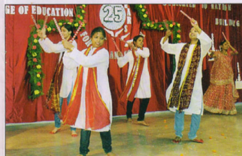
Two more colourful views of the Silver Jubilee and Foundation Day Celebrations