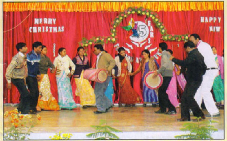
क्रिसमस के रंग में गाता-नाचता-झूमता महाविद्यालय परिवार