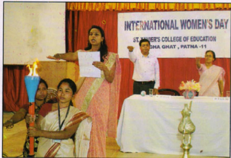
Oath for building a just & honest society free from violence against women

In her speech the chief guest said, "It's a right time to pay our homage to Nirbhaya and also stand firm to get united and see that justice is given to her and her family." She continued saying that