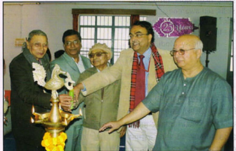
Inauguration of the Seminar : Lighting the ceremonial lamp